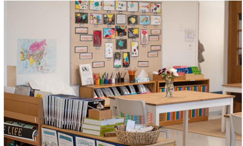
Learners showcase their artwork based on the Coming of the Universe.