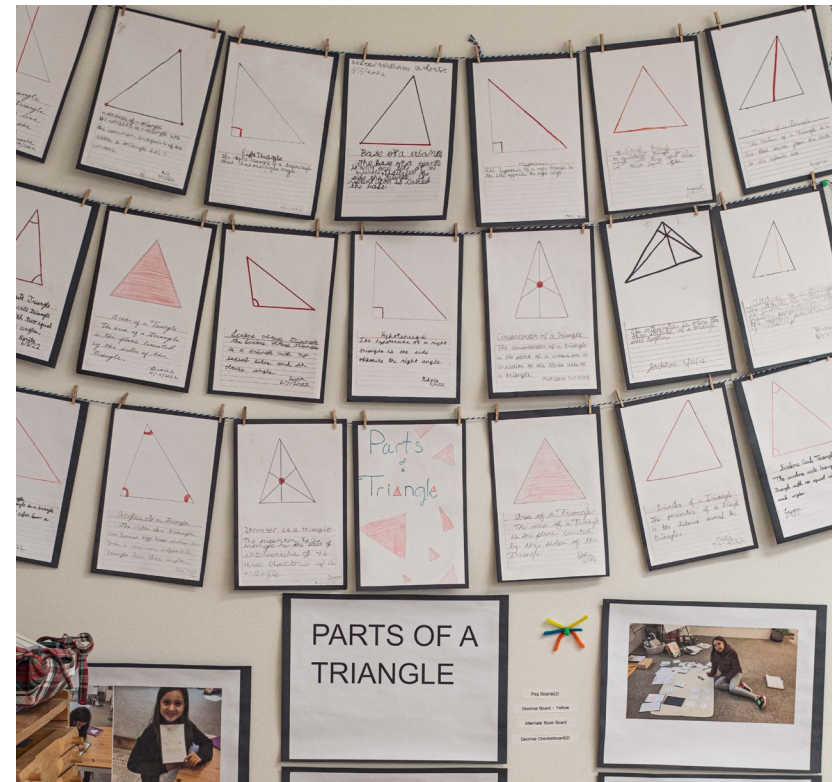
Learners use their knowledge of geometry to label parts of a triangle.

In the now and in the future, we need to know how to think, make predictions, see the whole. No Learner is dumbed down – they use real glass, real microscopes, take real charge of their day. They are given all they can and want to learn and more. That is the measure of a great curriculum.