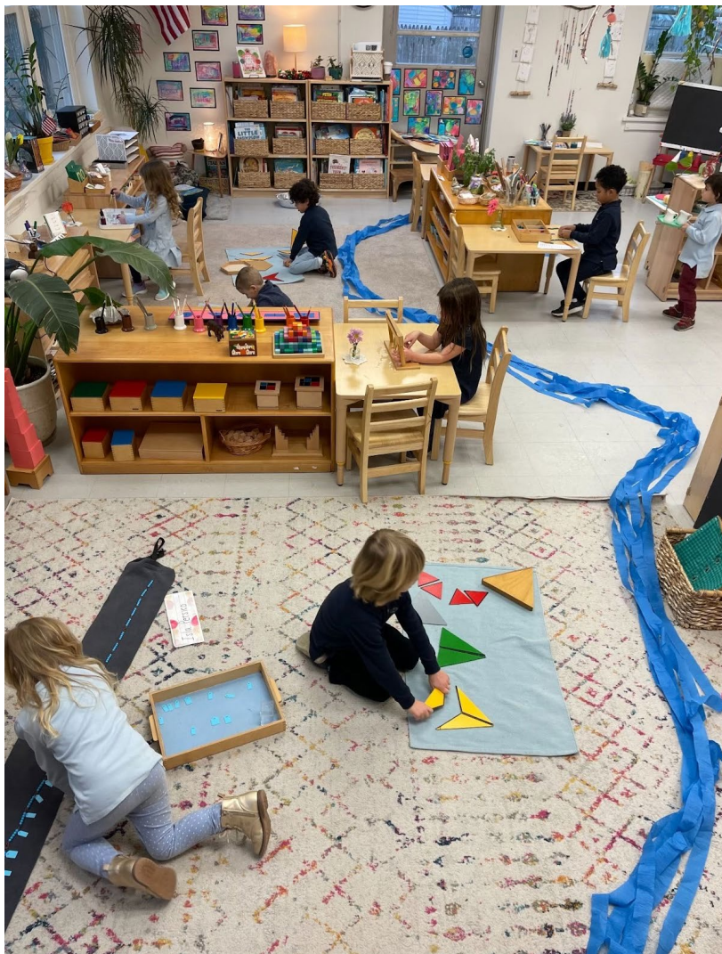
Parts of a River, Equilateral Triangles and Multiplication in Primary 3.