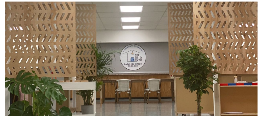
The School House AMI Training Center East Northport, NY

Visit Our Website TheSchoolHouse.org/AMI-Montessori-Training or Call us anytime at 631-261-9000 to register by March 1st.