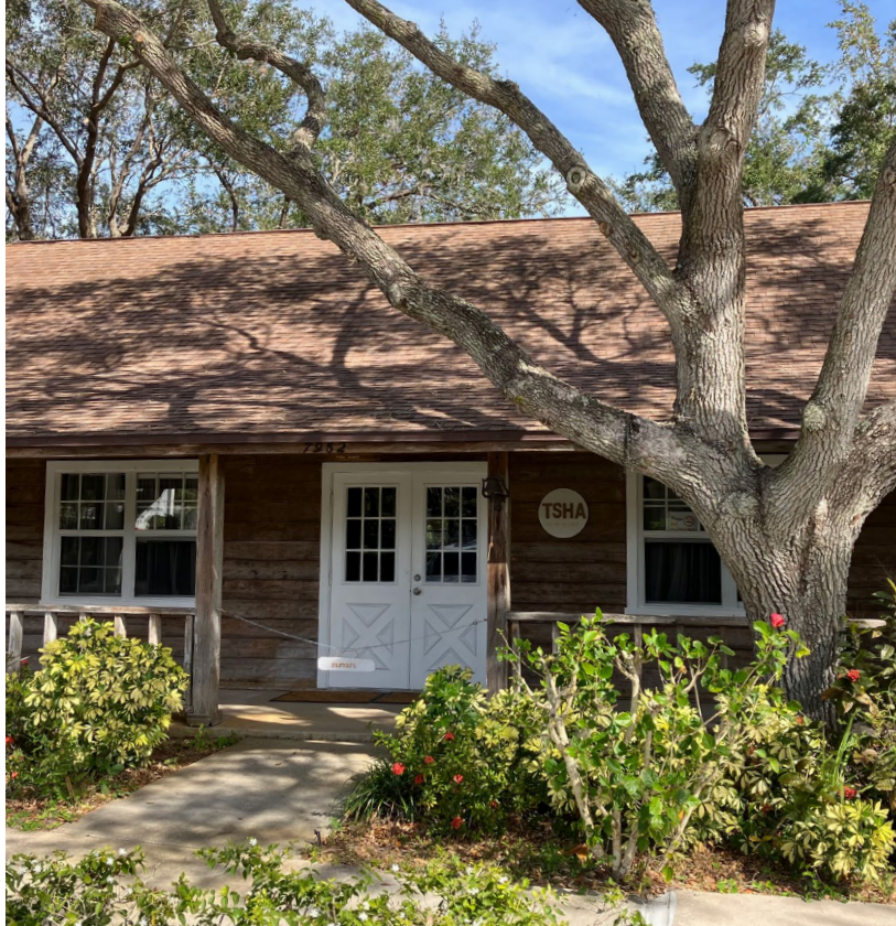
The School House Anywhere Vero Beach, FL