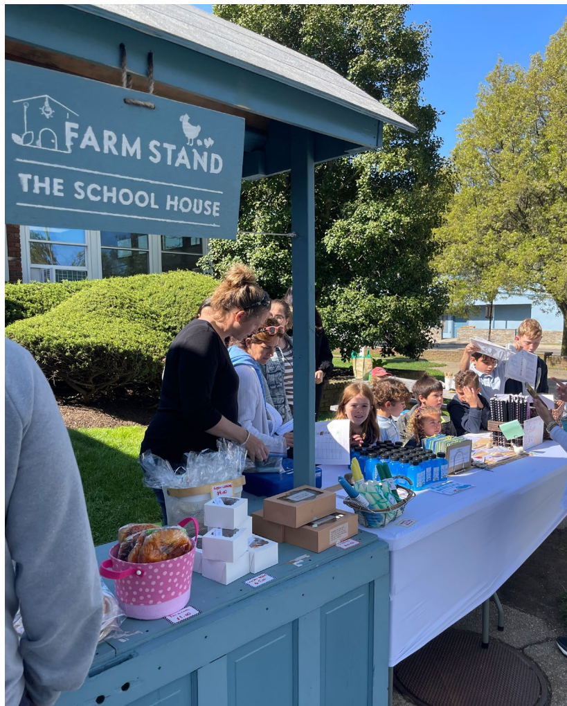
Learners prepare to sell a variety of goods at Farmstand.